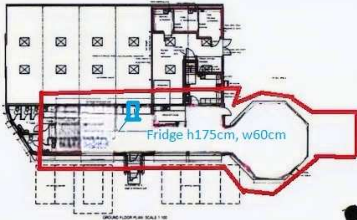
GROUND FLOOR PLAN SCALE 1:100

alcohol display 0.550 depth 0.600 width=0.33 total retail 6m2x10m2=60 0.550x0.600 divide 60x100= 0.55% retail space with alchcol display