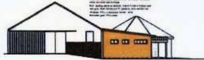
NORTH ELEVATION AS PROPOSED SCALE 1:100