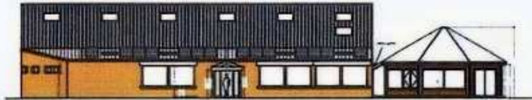
WEST ELEVATION AS PROPOSED SCALE 1:100