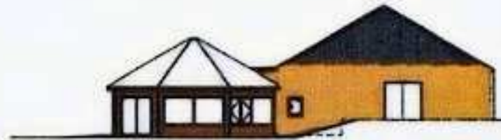
SOUTH ELEVATION AS PROPOSED SCALE 1:100