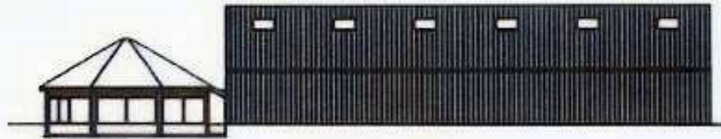
EAST ELEVATION AS PROPOSED SCALE 1:100